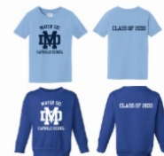
PreK 4 Uniforms

Additional T-shirts and sweatshirts will be on sale in the gym at Open House on Wednesday, September 6 . We did