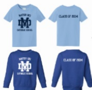
PreK 3 Uniforms